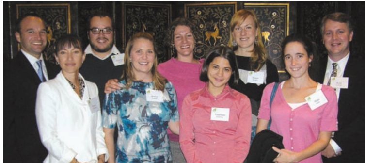
California Community Foundation scholarships help thousands of students pursue education, especially in a challenging economy. Here are 2009 recipients of the Fraser Scholarship, which annually awards about 30 scholarships totaling nearly $1 million to medical and divinity students.

Scholarship Funds Are a Meaningful Philanthropic Vehicle